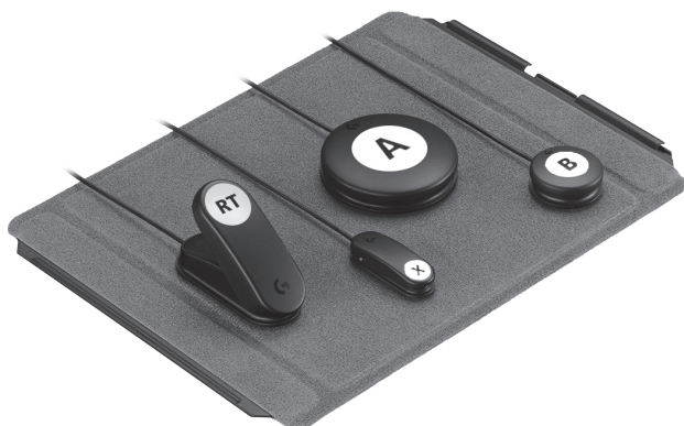
Warfighter Engaged Adaptive Gaming Kit